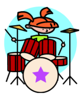
P7 Leavers Night – Carniny's Got Talent

Our P7 Leavers' Night is scheduled for Tuesday 25 June (7.00pm). The theme of the evening is "Carniny's Got Talent". An invitation will be issued to all parents of P7 pupils and school staff. In anticipation of a good attendance I thank parents for their support.